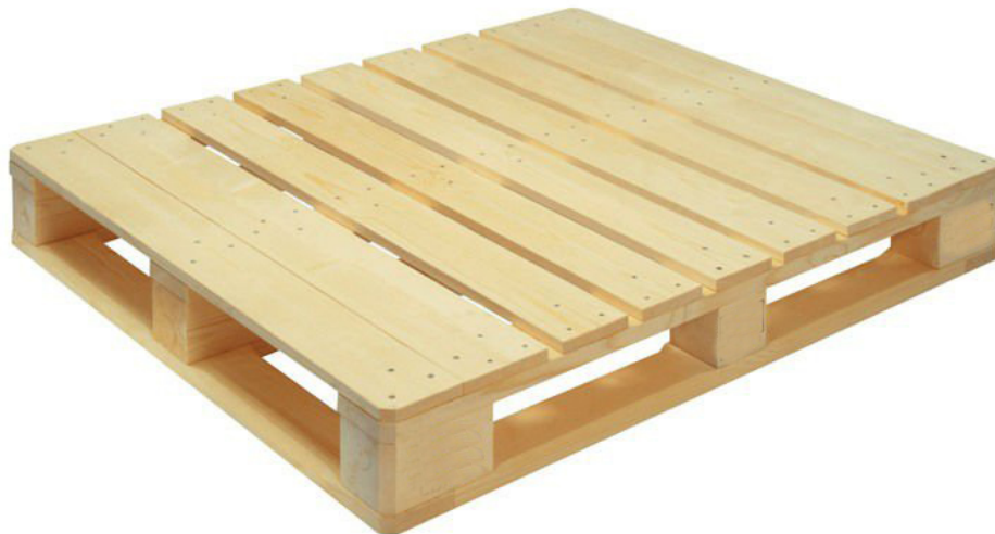
Standard Pallet 1.2m x 1.0m

Vow accepts CHEP pallets, but it is not a CHEP bank. Supplier is responsible for transferring ownership Via CHEP Portal, supplier needs to declare on paperwork how many CHEP they are sending.