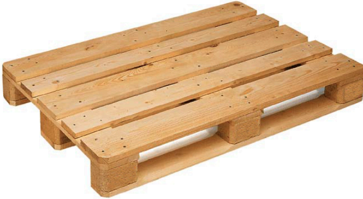
Euro Pallet 1.2m x 0.8m